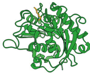
2022: Natural enzymes that can decompose plastic. The aim is to design proteins that can be used to recycle plastic.